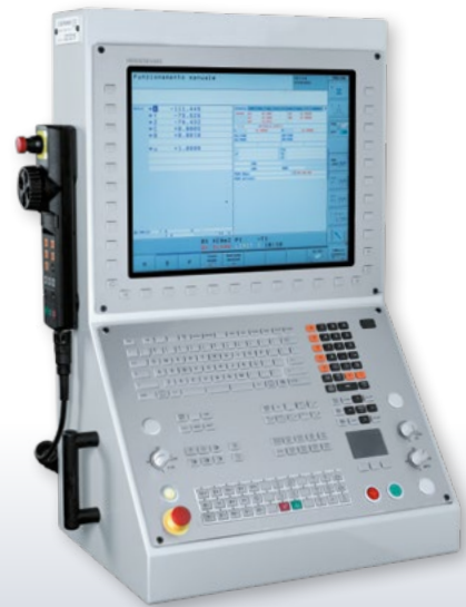
HEIDENHAIN TNC 640