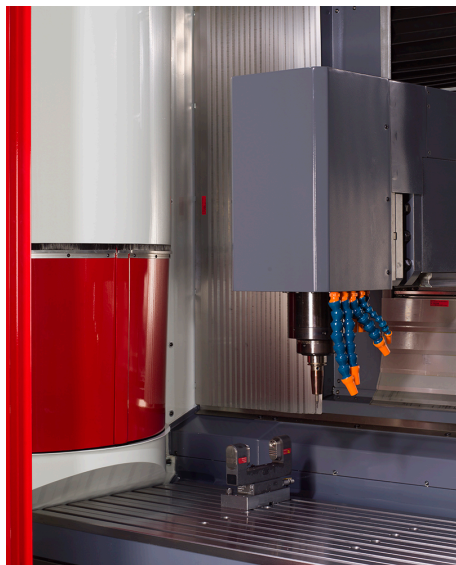
刀库 TOOLS MAGAZINE