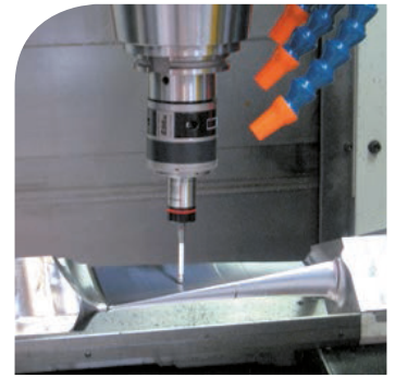
2D-3D 工件测量系统 2D-3D control piece group