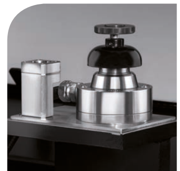
接触式对刀仪 Contact tools setting device