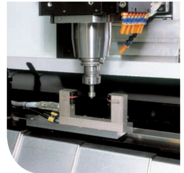
激光对刀仪 Laser tools setting device