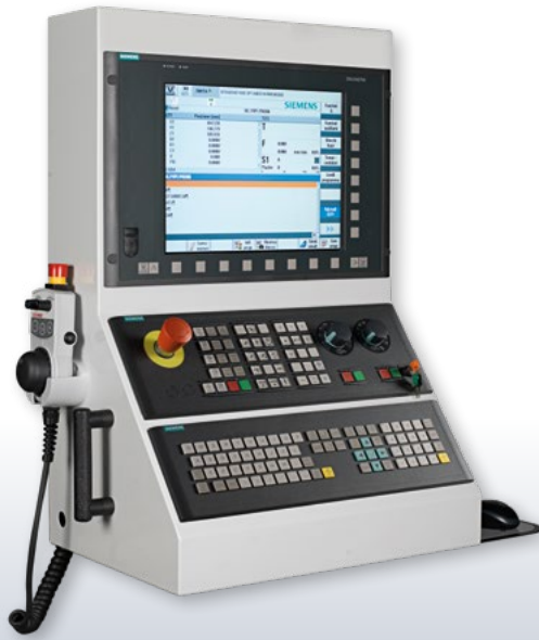
SIEMENS 840D SL