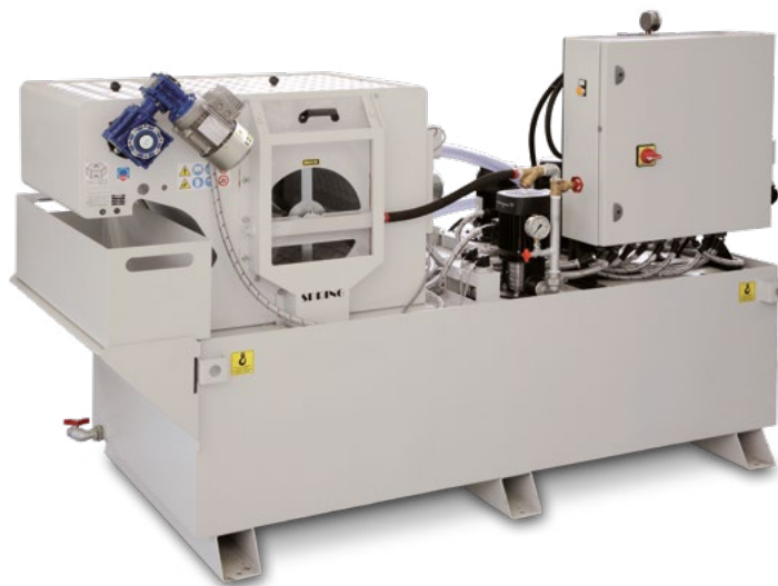
中心出水冷却单元 - 75 BAR 500升水箱 - 鼓式过滤器 THROUGH SPINDLE COOLANT GROUP - 75 BAR 500 lts tank - Drum filter